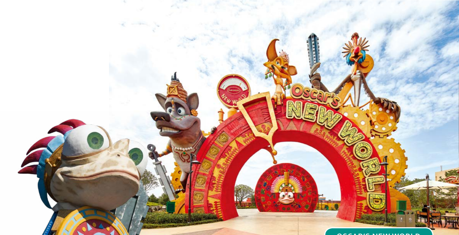
OSCAR'S NEW WORLD

The animated characters called "Red" and "Yellow" are such huge giants that they make humans look like tiny larvae. Come and see the world through Larva's eyes. Exciting rides, a playground everyone can enjoy and a variety of attractions whose architecture are modelled after various kinds of food can all be found in Larva's Adventure Village. Embark on a trip around the world or a space trip with the animated characters of Larva.