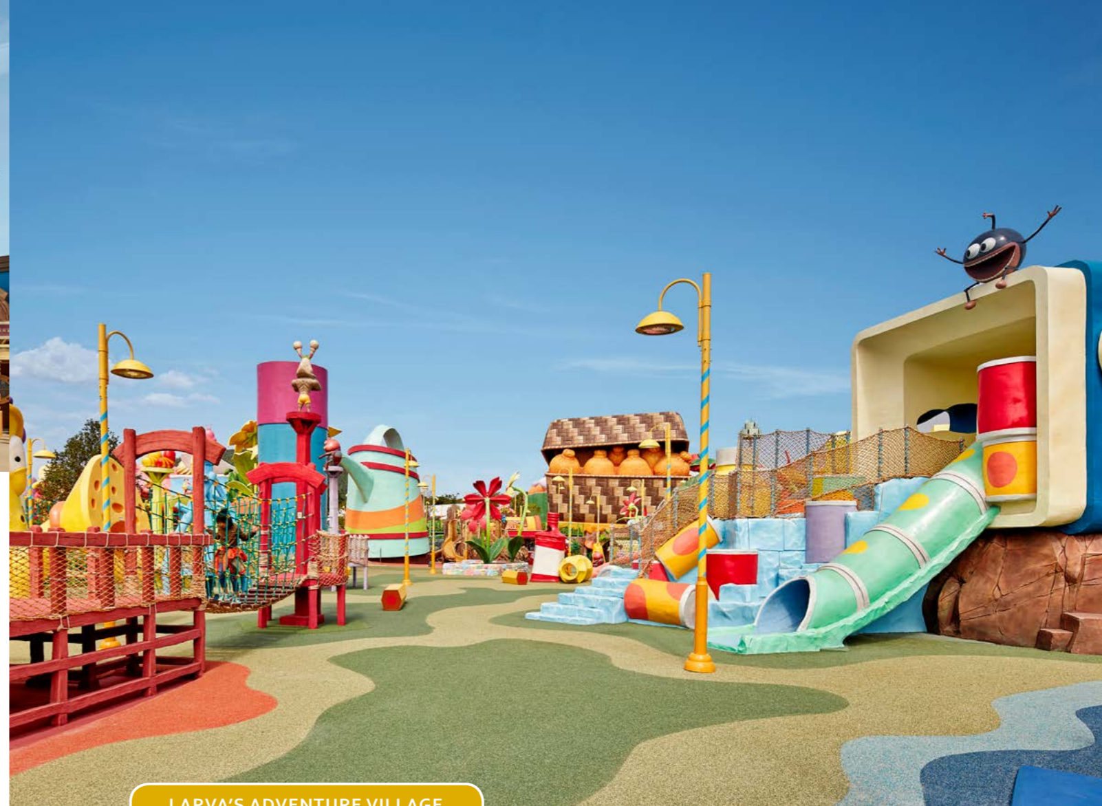
LARVA'S ADVENTURE VILLAGE